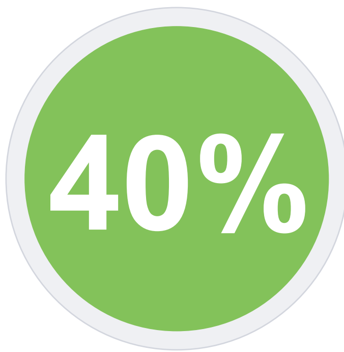
Host meetings for 500 attendees or more

Collectively, MPI THCC's nearly 140 planners hold over 500 events per year throughout the US and Southwest as primary region followed closely by Southeast and Northeast.